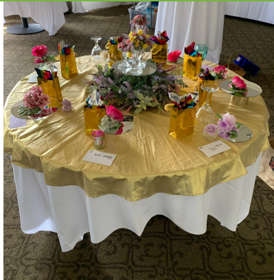
Left: Golfers enjoy dinner at the VINA Charity Golf Classic. Right: The jewelry raffle table at VINA's Throwback Prom.

VINA had two of our annual fundraising events - the Throwback Prom in the spring and the 10th Annual Charity Golf Classic in July. Thank you to all the attendees, donors and sponsors who helped make these events successful!