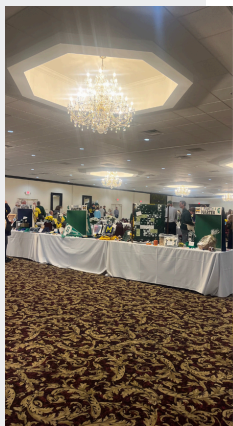
2024 VINA Tailgate Fundraising Event